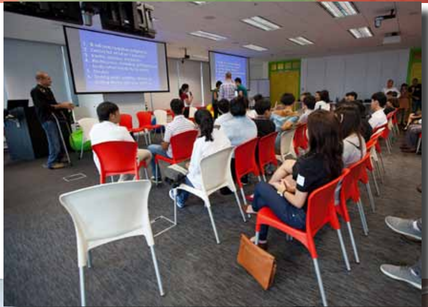
right & bottom: Mentorship program at Google, Singapore

Presented motivational talk to ITE students as part of an ongoing mentorship program spearheaded by the US Embassy in Singapore.