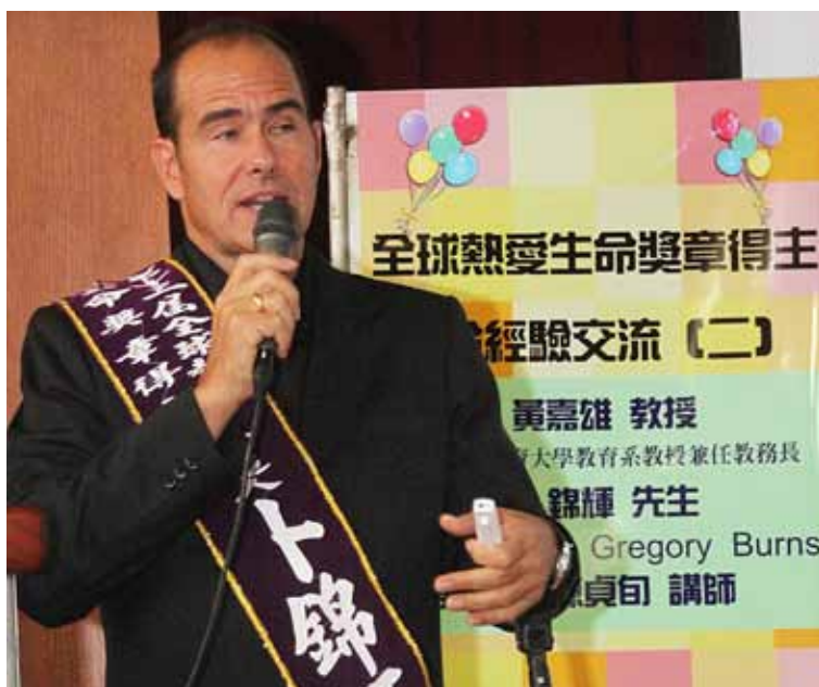
above: Speaking to schools throughout Taiwan with other achievers for the Chou Da Kuan Foundation.