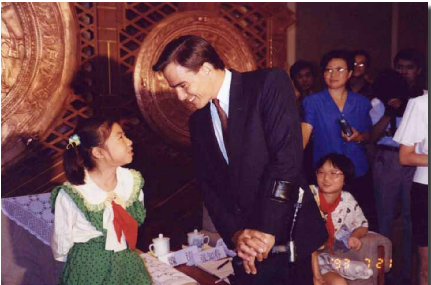
above: Award ceremony at the Great Hall of the People in Beijing for China's talented disabled artists.