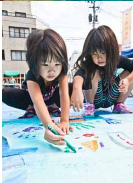
above & left: Outreach program for children in Kesennuma, Japan