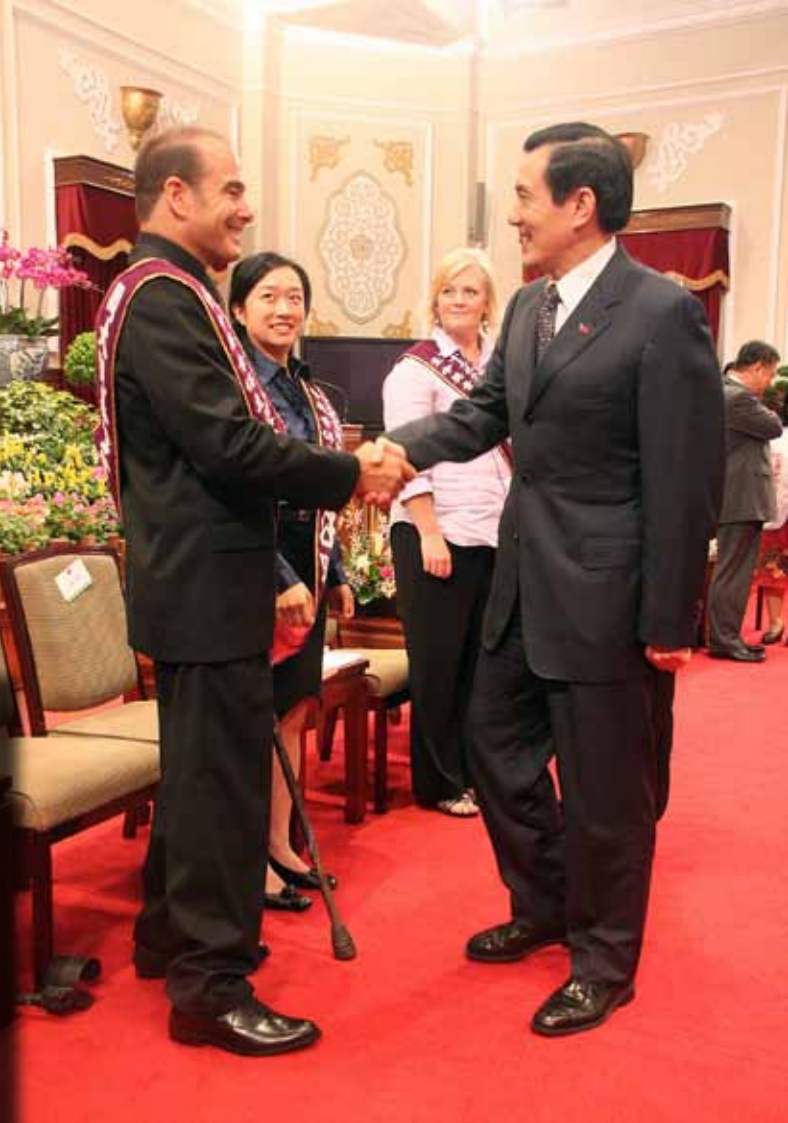
above: Reception for the recipients with President Ma at Taiwan's Presidential Palace.