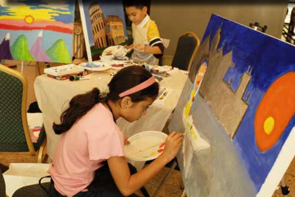
above: 'Journeys' art program for children, Singapore and Sydney.

2004- Credit Suisse Community Initiative 'Journeys' with VSA Singapore: Art Program Director