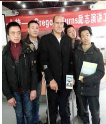
above: CereCare Wellness Shanghai, China

2011-2014- United States Embassy in China Traveled to six cities across China to present two-dozen talks and workshops to varied groups of disadvantaged children and the general public as part of the US Embassy's outreach program in China.